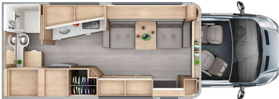
W24MB | Murphy Bed