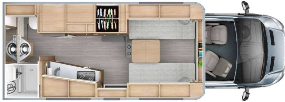
W24FTB | Front Twin Bed