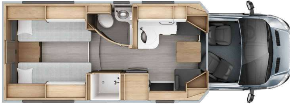
W24RTB | Rear Twin Bed