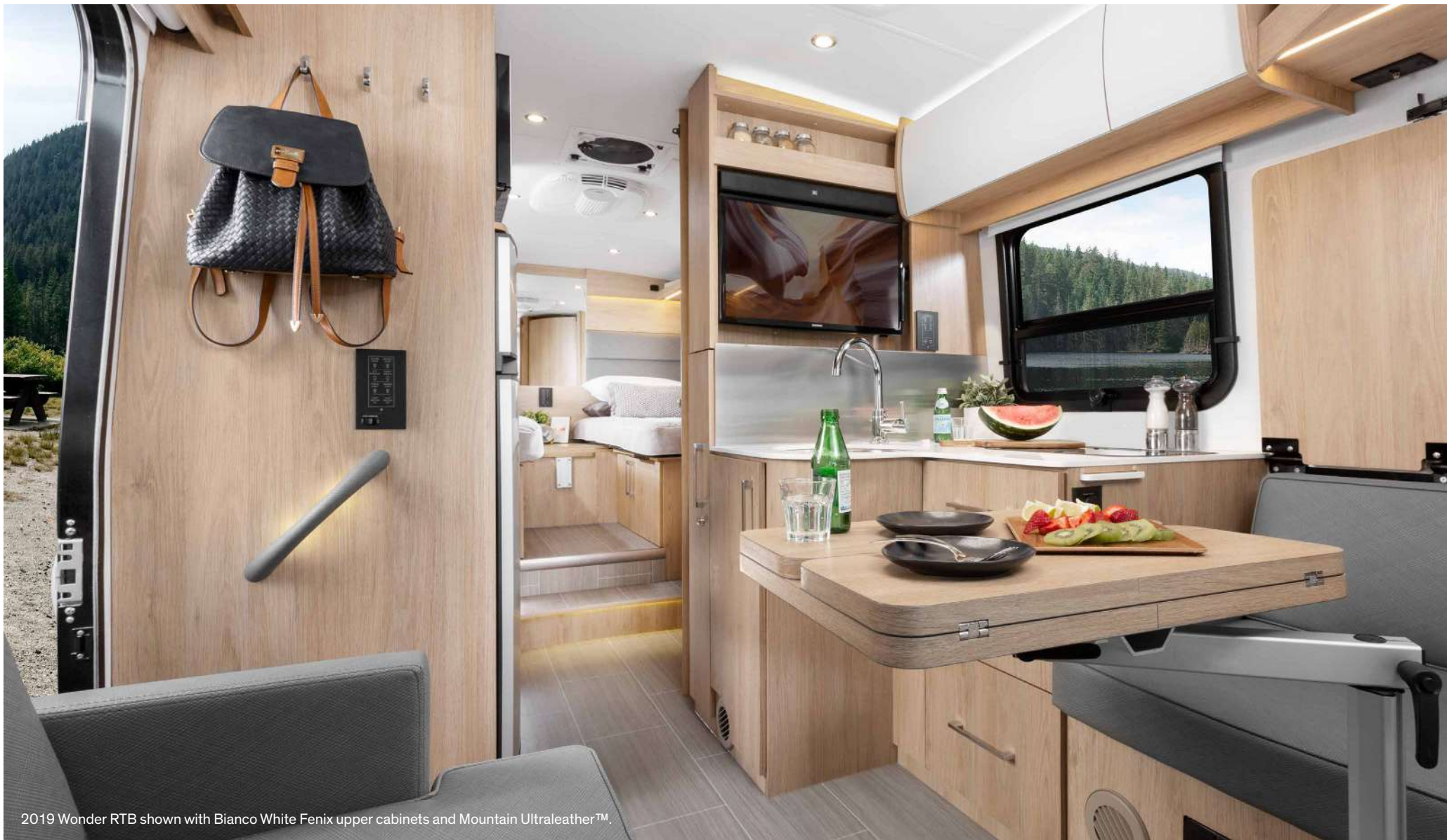
2019 Wonder RTB shown with Bianco White Fenix upper cabinets and Mountain Ultraleather™.