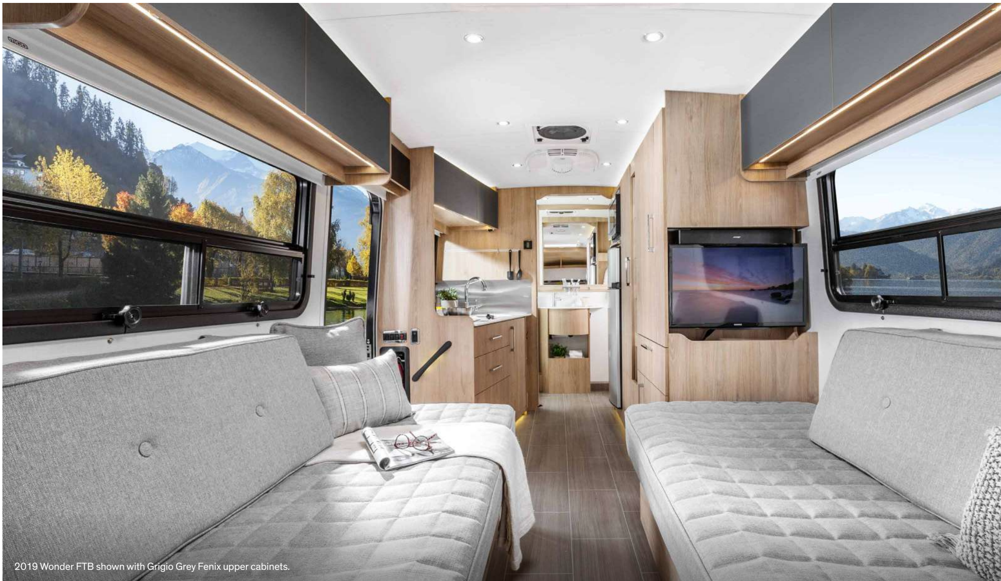
2019 Wonder FTB shown with Grigio Grey Fenix upper cabinets.